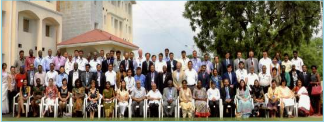
International Conference on R & R and Benefit Sharing, May 20-24, 2013

"Let us be together, let us interact together, and may our minds comprehend together"