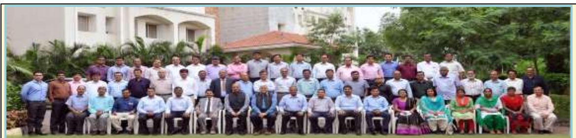
National Conference on Land Acquisition for Infrastructure Projects, August, 16-17, 2017