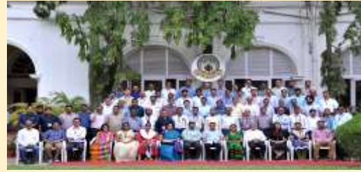
Five-day LARR Course, October 2019 89 Nominations