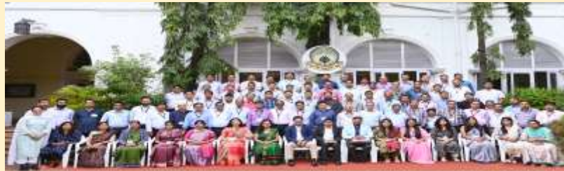
Course on Avoiding Costly Mistakes in Land Acquisition and Resettlement (October 10-14, 2022) Centre for Management of LARR (CMLARR) Administrative Staff College of India, Hyderabad, India