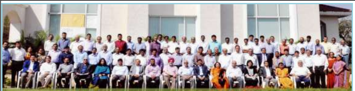
National Conference on RFCTLARR Act, 2013, February 17-18, 2014