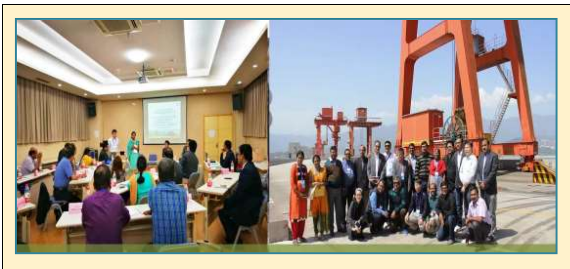
ASCI-NRCR Joint Certificate Course: Participants at Site of World's Largest Hydro-project- The Three Gorges Project, China (Held every year Annually 2017-18 to 2019-20)