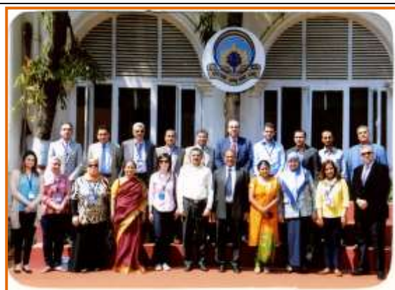
Team of Egyptian Senior Government Officials at ASCI in March 2016