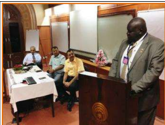
Mr. Aidah Nantaba, Hon'ble Minister of State for Lands, Govt. of Uganda at ASCI in May 2015