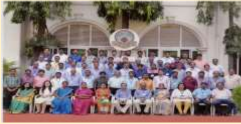
Five-day LARR Course, October 2015 75 Nominations